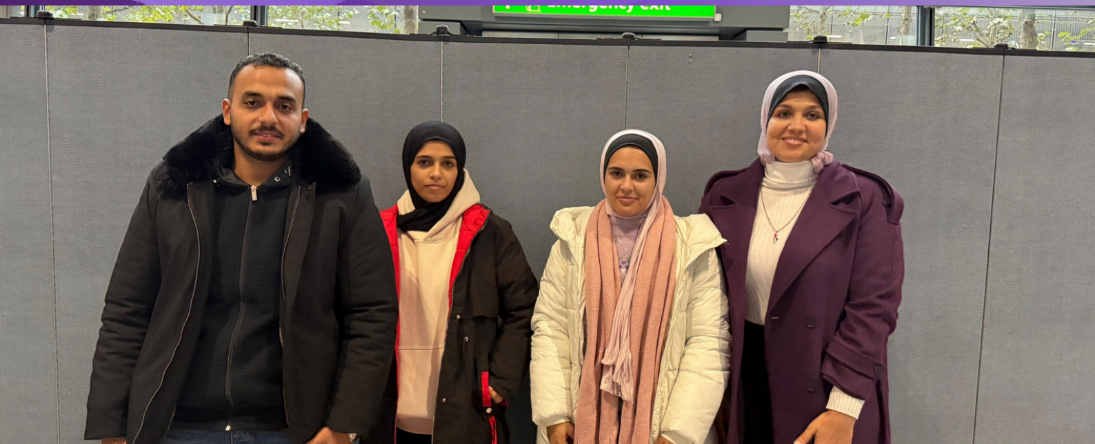
The Gaza Emergency Relief Fund Students Arriving in the UK